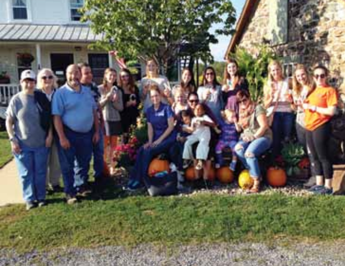
Associates, clients, and friends visited the pumpkin patch at the Green Barn Berry Farm in Muncy.