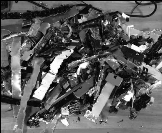
HARD DRIVE DESTRUCTION